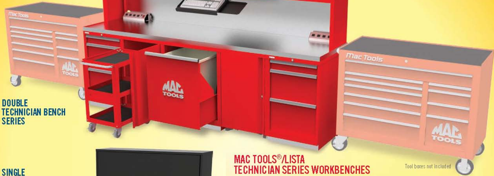
DOUBLE TECHNICIAN BENCH SERIES