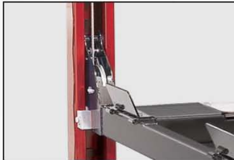
Heavy-duty front bearing and yoke assemblies distribute contact load to reduce column stress for longer product life.