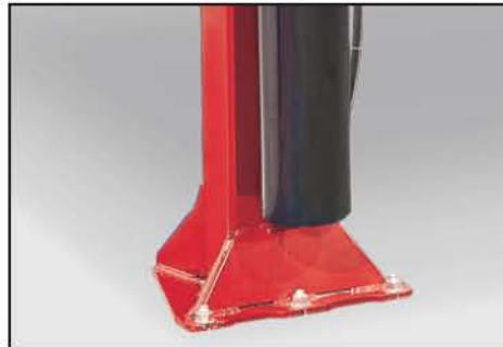
Fully gusseted base plate design reduces column deflection and makes lift less sensitive to uneven floors.