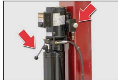
Single point air actuated mechanical lock release allows technician to disengage columns simultaneously.