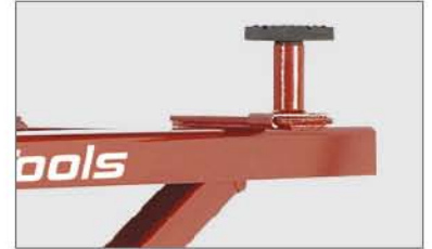
Sliding/rotating arm design reaches pick-up points on a wider range of vehicles.