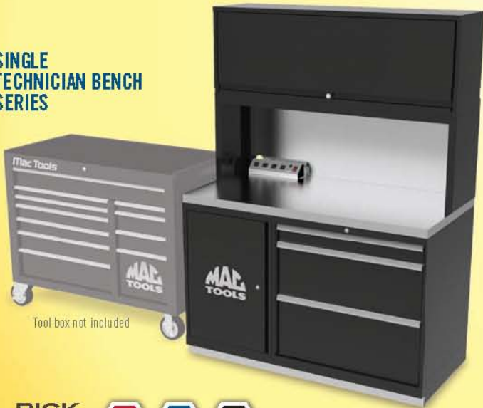
SINGLE TECHNICIAN BENCH SERIES