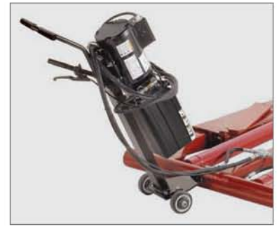
Electric motor mounted on tow dolly provides convenience and ease of maneuverability.