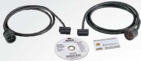
Heavy-Duty Scan Targets Class 4-8 Trucks